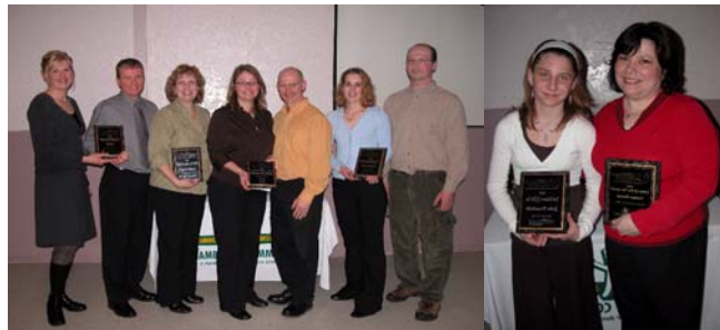
Above are the award recipients for the 2006 Mark of Excellence Awards.

Tickets for the event will be available in early January. For further information, contact the Chamber office.